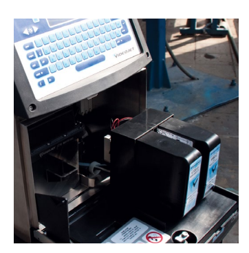
Smart Cartridge™ fluid delivery system in the Videojet 1710 coder

"When you combine our high production speeds, hot temperatures and factory environmental conditions, you need tough inks—and a printer that won't clog up when you run them," Ju ChaoRong explains. "We've found this with Videojet. We can run any ink we need—including pigmented, high-contrast ink—in the 1710 coders without problem. And the ink dries very quickly with excellent adhesion, supporting our fast production speed."