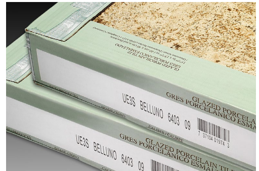
High-resolution large character inkjet on white corrugate

Ask your local Videojet representative for more guidance, a production line audit, or sample testing in our sample laboratories.