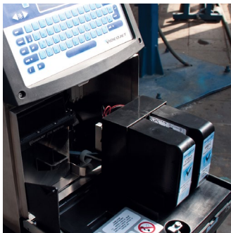
Smart Cartridge™ fluid delivery system in the Videojet 1710 coder

“When you combine our high production speeds, hot temperatures and factory environmental conditions, you need tough inks—and a printer that won't clog up when you run them,” Ju ChaoRong explains. “We've found this with Videojet. We can run any ink we need—including pigmented, high-contrast ink—in the 1710 coders without problem. And the ink dries very quickly with excellent adhesion, supporting our fast production speed.”