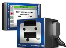
Videojet DataFlex 6420 thermal transfer overprinter