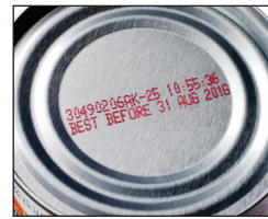
CIJ on metal can