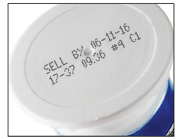
CIJ on plastic cap