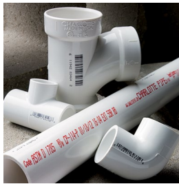
Continuous inkjet codes

Videojet coding solutions are designed to help manufacturers print the highest quality codes while maximizing efficiency and minimizing unexpected downtime.