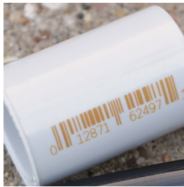
Laser code (color change)

Printed codes and marks are often the most visible indicator of your brand values and product quality. The legibility and appearance of logos, production and time stamps, bar codes and other marks can all contribute to perceived quality.