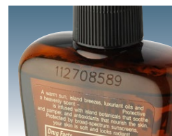
Laser code direct to spray bottle