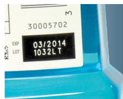
Laser code in a knock-out box