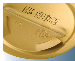
Black CIJ code on a colored bottle

Videojet offers a sample lab service and can provide you with various codes using different technologies on your packaging. The lab can suggest the optimal technology for all of your packaging and send samples to help you make an informed decision before you invest in a coding solution.