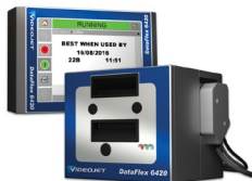
Videojet DataFlex 6420 thermal transfer overprinter