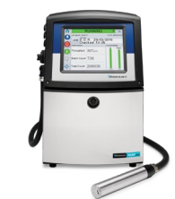
Videojet 1650 UHS continuous inkjet printer

All Videojet solutions feature CLARiTY™ – a large, touch screen, intuitive user interface that provides ease of use and continuity for all operators, regardless of expertise, knowledge and printer interaction. Our built-in CLARiSUITE™ software helps you comply with food labelling standards and meet new demands for additional label content. It also offers Code Assurance features to make job creation, edits and product changeovers simple and practically impossible to get codes wrong.