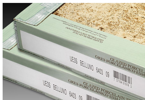
High-resolution large character inkjet on white corrugate

Ask your local Videojet representative for more guidance, a production line audit, or sample testing in our sample laboratories.