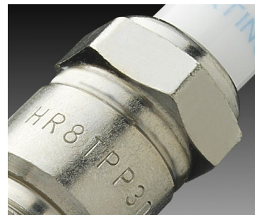
Overt coding: Permanent code