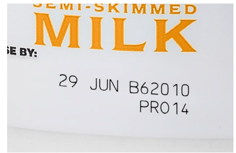
Laser reactive marking

For light colored aseptic packaging, an alternative approach is to incorporate a laser receptive pigment into the topcoat ink when the package is manufactured. This pigment is typically applied to a small area, or patch, where you want to mark. The laser energy interacts with the pigments and changes color to produce a clear, durable, permanent code.