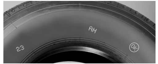
High impact codes in red, yellow, blue and white