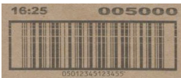
Printer cleaner off